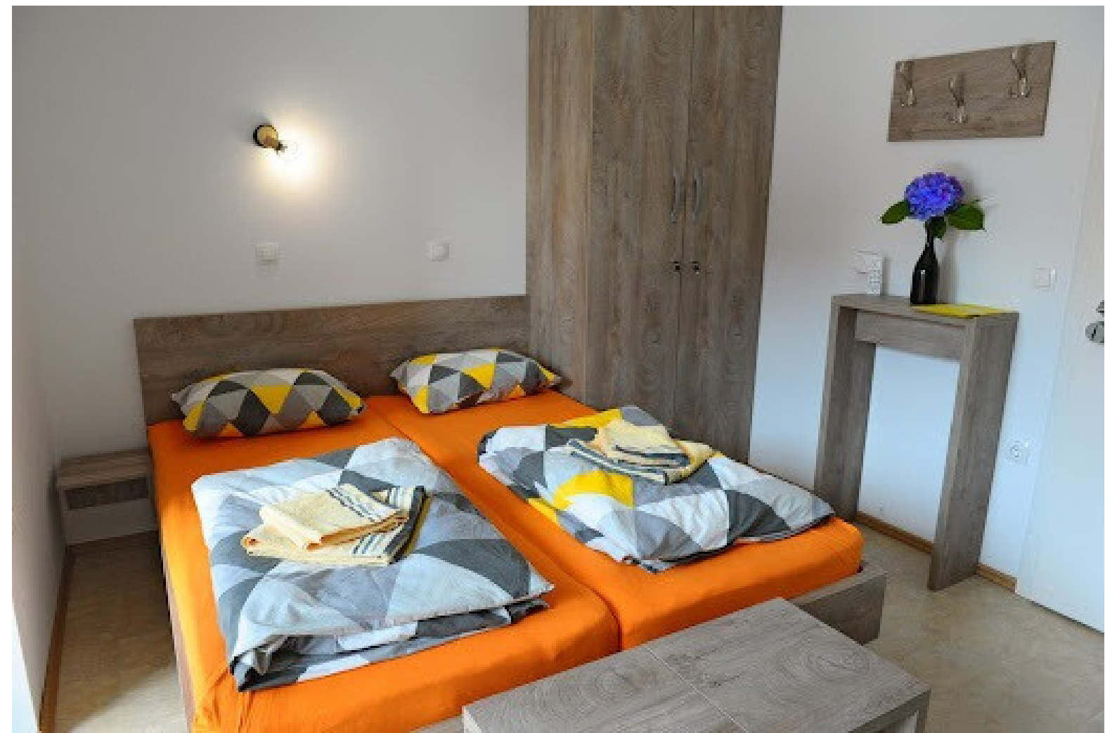
Hostel ORMOŽ, Kerenčičev trg 11, 2270 Ormož