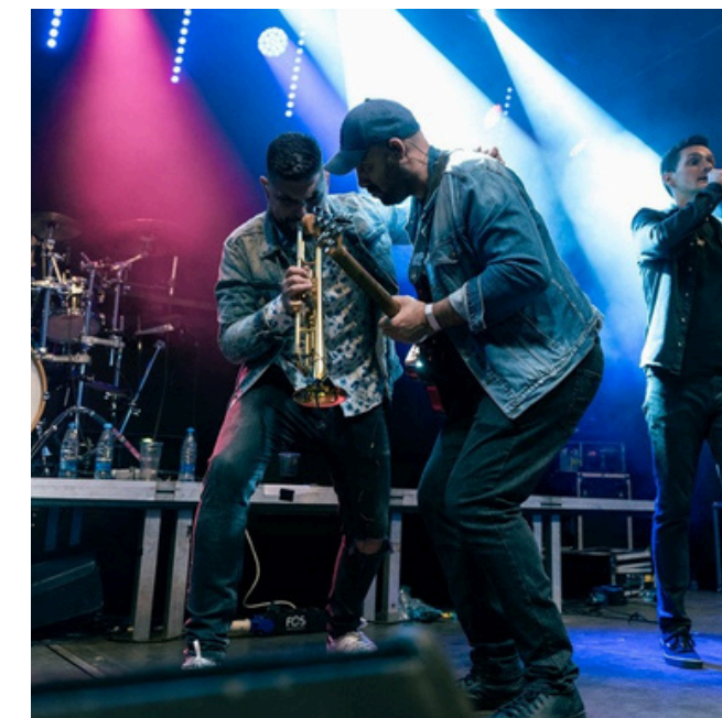
Zbudi se, Ormož!